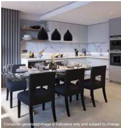
Computer-generated image is indicative only and subject to change