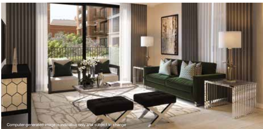
Computer-generated image is indicative only and subject to change