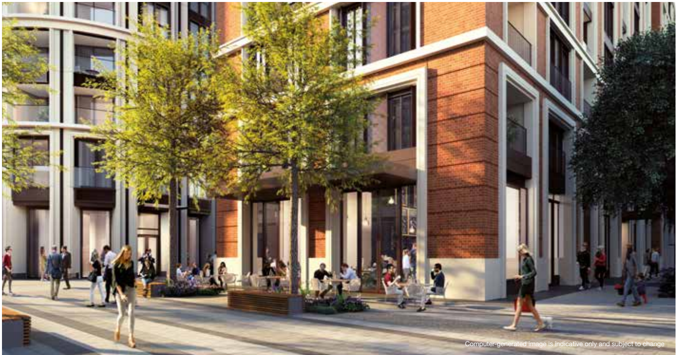
Computer-generated image is indicative only and subject to change