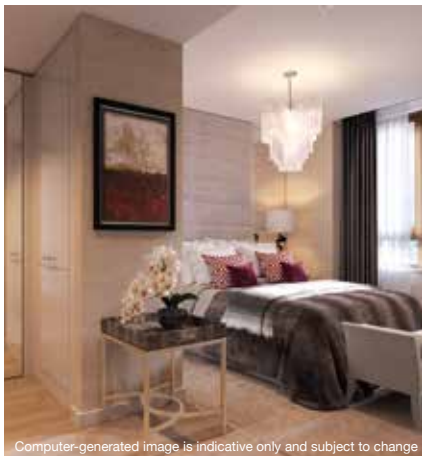
Computer-generated image is indicative only and subject to change